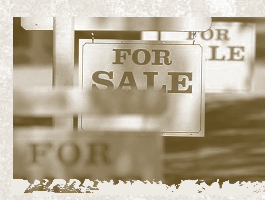
Real Estate Signs