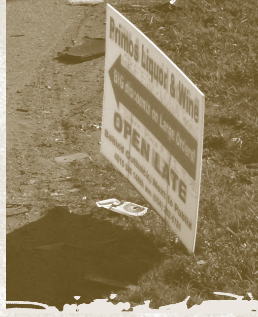
Snipe Sign Example

There is a difference between these types of signs and those that are found along roads such as real estate signs, or other signs which are properly permitted. You can always contact the Code Enforcement Department at (954) 434-0008 if you have any questions related to this new ordinance.